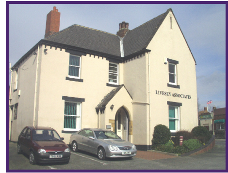
(Above: Our Office)

Leave the M1 at junction 41 (signposted Wakefield, Morley), then at the roundabout take the Royston Hill - A650 road (signposted Morley, Bradford). Then Continue straight on until you see a public house called 'The Bay Horse' on your right and a BP Petrol Station opposite, immediately after the public house turn right on to Thorpe Road. You will then see our office straight away on the left hand side of the road.